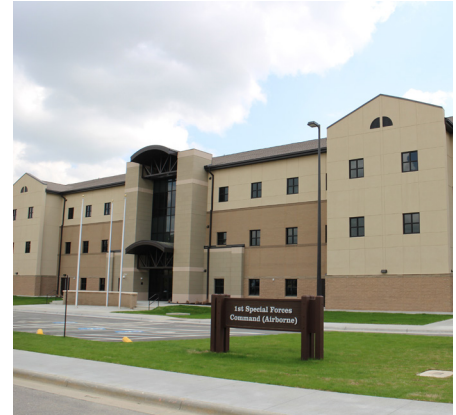
SOF Group Headquarters