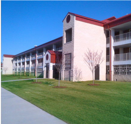
TBUP Barracks Renovations