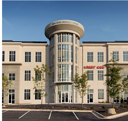
New Hope Medical Office Building