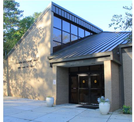
Abernathy Arts Center

EDT's integrated and unified project team, assembled from the outset of every project, has the added benefit of all key disciplines found under one roof. Over the past 15 years, EDT has delivered over $1 billion in D-B projects in both public and private sectors.