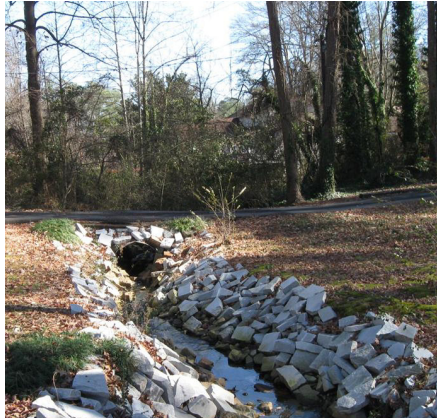
DeKalb County Stormwater Upgrade