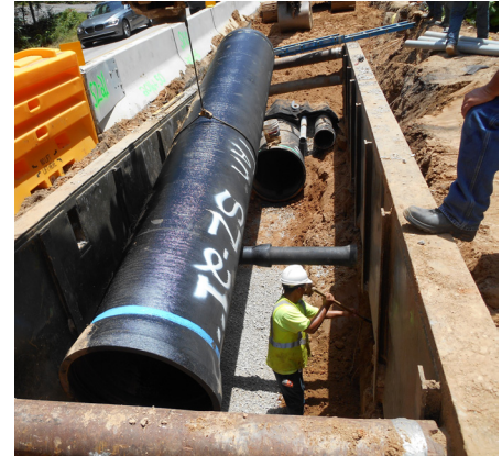
North Area Water Main Replacement, Section 2