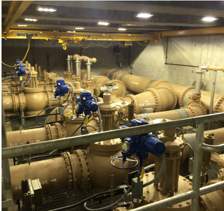
COA Peachtree Creek South Fork Relief